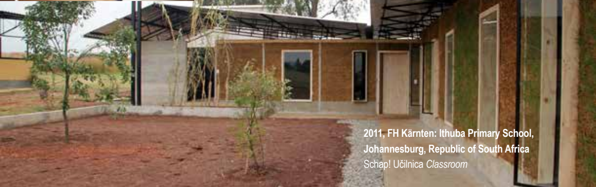
2011, FH Kärnten: Ithuba Primary School, Johannesburg, Republic of South Africa Schap! Učilnica Classroom