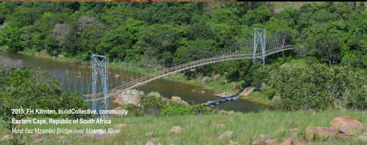
2015, FH Kärnten, buildCollective , community Eastern Cape, Republic of South Africa Most čez Mzambo Bridge over Mzamba River