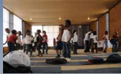
2011, Faculty of Architecture, University of Ljubljana: Ithuba Primary School Johannesburg, Republic of South Africa Večnamenska dvorana Multipurpose hall