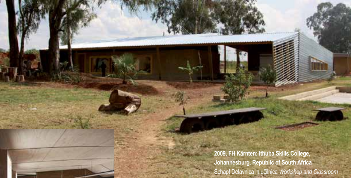
2009, FH Kärnten: Ithuba Skills College, Johannesburg, Republic of South Africa Schap! Delavnica in učilnica Workshop and Classroom