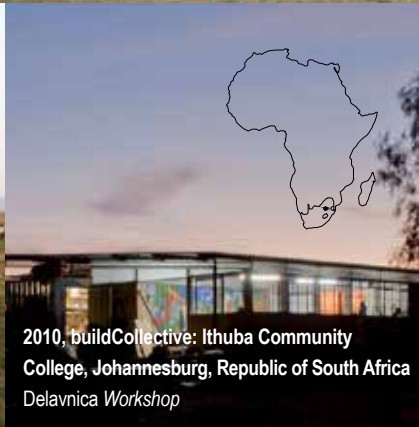
2010, buildCollective : Ithuba Community College, Johannesburg, Republic of South Africa Delavnica Workshop