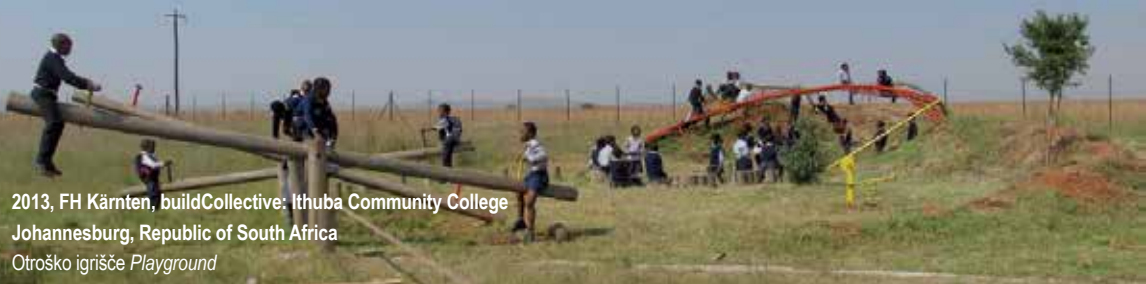
2013, FH Kärnten, buildCollective : Ithuba Community College Johannesburg, Republic of South Africa Otroško igrišče Playground