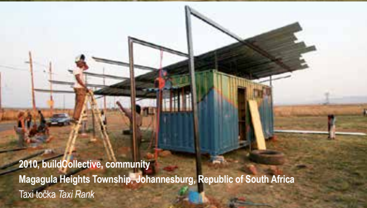
2010, buildCollective , community Magagula Heights Township, Johannesburg, Republic of South Africa Taxi točka Taxi Rank