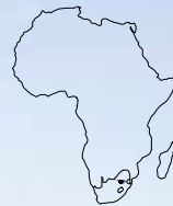
2010, Faculty of Architecture, University of Ljubljana: Ithuba Community College Johannesburg, Republic of South Africa Knjižnica in učilnica Library and Classroom